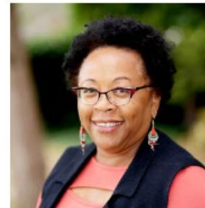
Kym Johnson (she/her) BANANAS